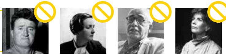
Brendan Behan Kate O'Brien Frank O'Connor Edna O'Brien

My name is Brendan Behan, I'm the latest of the banned Although we're small in numbers we're the best banned in the land We're read at wakes on weddings and in every parish hall And under library counters sure you'll have no trouble at all